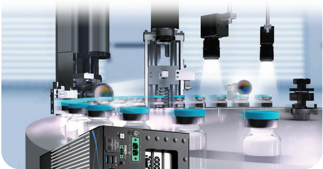
^ High-Speed AOI

AI Computing System with NVIDIA® Tesla®/Quadro®/GeForce®/AMD Radeon™ Graphics