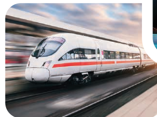
v Rolling Stock