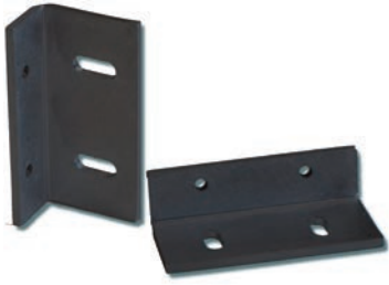
Rack Mounting Ears