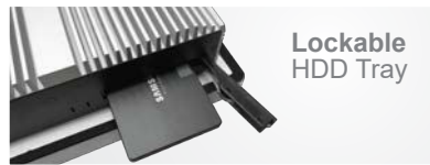
Lockable HDD Tray