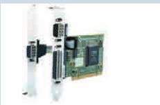
UC-475: uPCI 1xRS232 + 1xLPT Printer Port