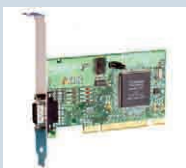
UC-324: uPCI 1xRS422/485 1MBaud