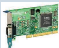
UC-320 LP uPCI 1xRS422/485 1MBaud