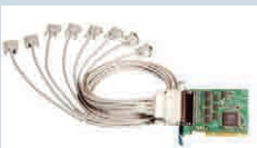
UC-279: uPCI 8xRS232