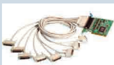
UC-275 uPCI 8xRS232 DB25