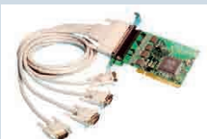
UC-268: uPCI 4xRS232