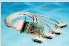
UC-265 uPCI 4xRS232 DB25