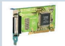
UC-157: LP uPCI 1xLPT Printer Port