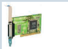
UC-146: uPCI 1xLPT Printer Port