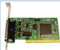
UC-083 uPCI 4xRS232 Opto Isolated TX RX GND CTS RTS