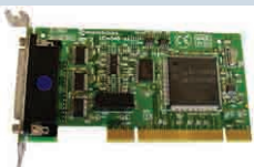
UC-061: LP uPCI 4xRS232 Opto Isolated TX RX GND CTS RTS