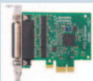
PX-260: LP PCIe 4xRS232 1MBaud