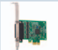
PX-701: PCIe 4xRS232 1MBaud