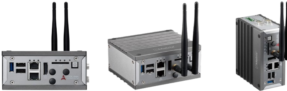
MXE-200/200i with Antenna