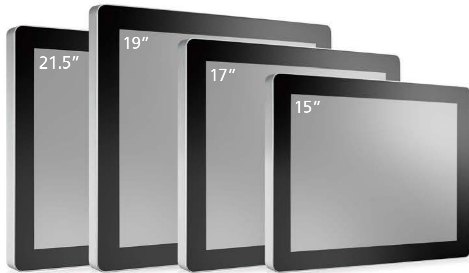
Flexible customized display size : 7" to 55"