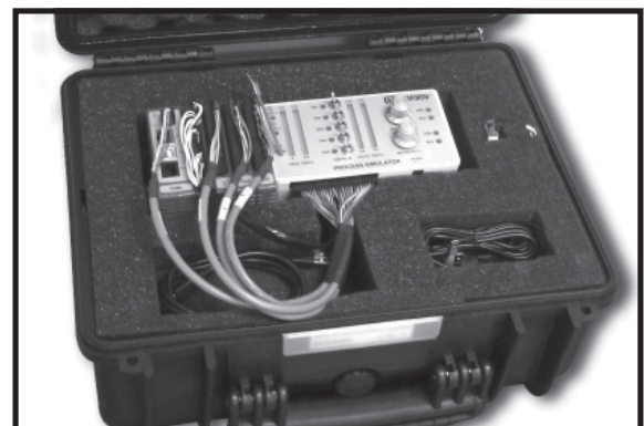
Figure 3: MAQ20 Demonstration Suitcase