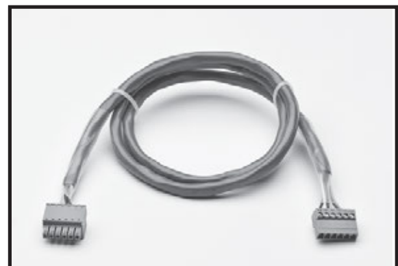
Figure 2: Backbone Expansion Cable