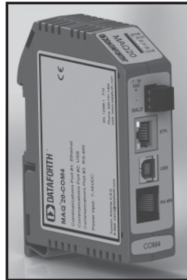
Figure 2: Communications Module