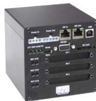
Core Module consists of NIC and PowerPC CPU layers stacked on top of each other and packaged in light-weight aluminum chassis.